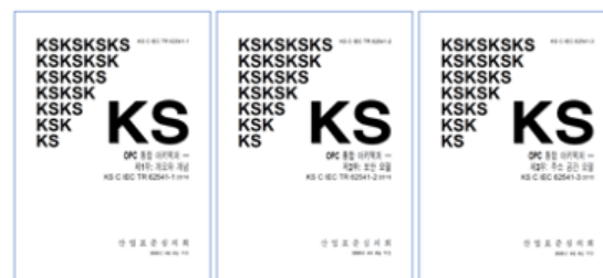
IEC62541 KS Standard

As mentioned earlier, KETI established an SMIC model factory (@Ansan, South Korea) in 2016 in order to showcase smart factory technologies in various manufacturing fields. The team has demonstrated various use cases through OPC UA with various solution vendors and developers in the market. In 2021, a second model factory, focusing on the machine building industry, was newly established in Changwon, the central city of the machinery industry. In particular, the new model factory was built on a digital twin basis to service as an actual manufacturing process that enables actual production of components – not just a demonstration – with 22 suppliers, including major Korean machine tool companies. In addition, it is a test bed that supports demonstration of interworking between various IT and OT applications, such as AI-based data analysis and process optimization. These various IT solutions and OT elements are linked and demonstrated through OPC UA.