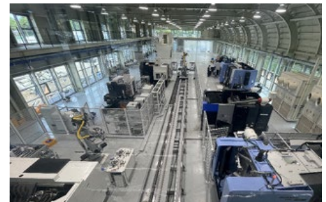
SMIC Model Factory, Changwon South Korea

While looking back on our prospects and plans in recent years, COVID-19 created a major crisis across the industry and our personal daily lives, but it has also provided an opportunity to recognize and develop the importance of virtualization and interoperability technologies. In line with these alternative solutions, OPC Korea will continue to distribute and promote various media from the OPC Foundation throughout the Korean manufacturing market using online methods in the virtual world, all the while striving to strengthen a healthy and larger manufacturing ecosystem using OPC UA, centered on SMIC demo plants.